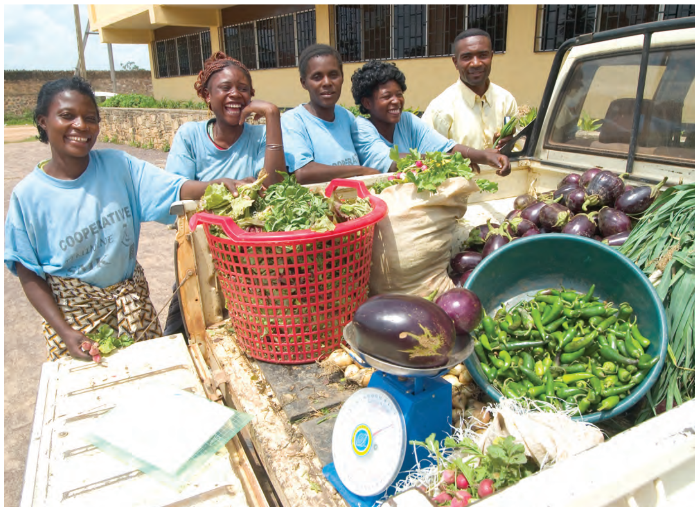
Selling produce grown as part of Anvil’s market garden programmes

of the world’s arable land but produces only 9% of the world’s agricultural output and in mining exploration expenditure per square metre, at $US15/sq m, is far inferior to developed countries such as Australia and Canada where it is as high as $US65/sq m.”