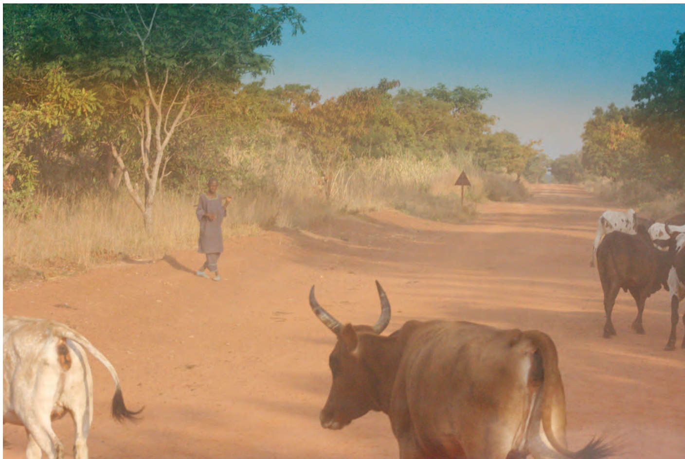
Not all of Africa's land is arable but a focus on livestock by mining companies can still bring sustainable practises