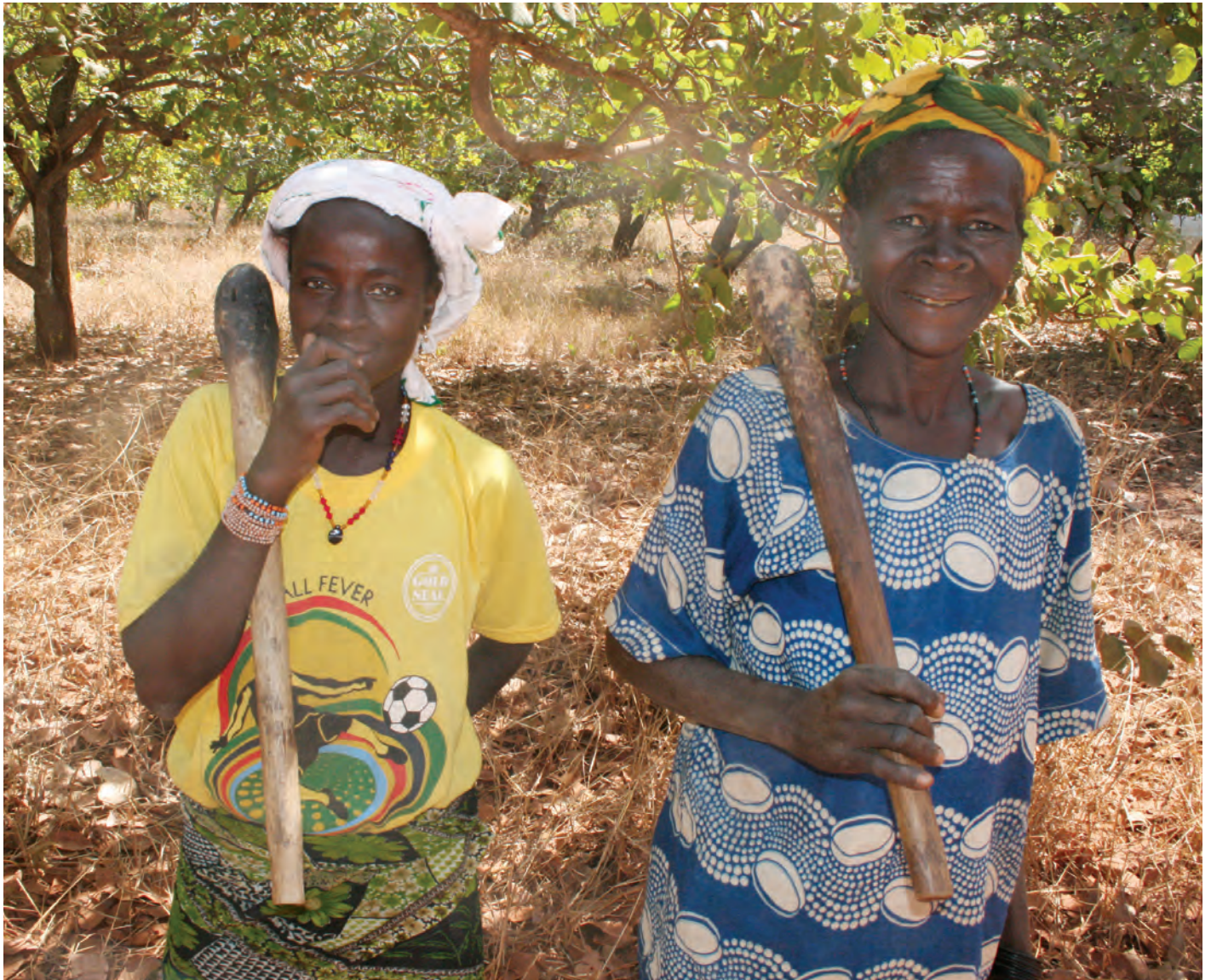
Most African smallhold farmers are women. Engaging them from the start in community programmes can be vital to successful implementation