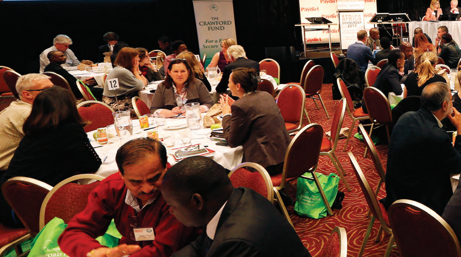
The Crawford Fund/Africa-Australia Research Forum conference attracted more than 300 delegates from academia, government, NGOs, mining and agriculture

He said that agricultural transformation had been behind many economic success stories in Asia, Latin America and Europe. This was achieved on the back of policies which promoted investment in natural resources but in Africa the incentives were not in place.