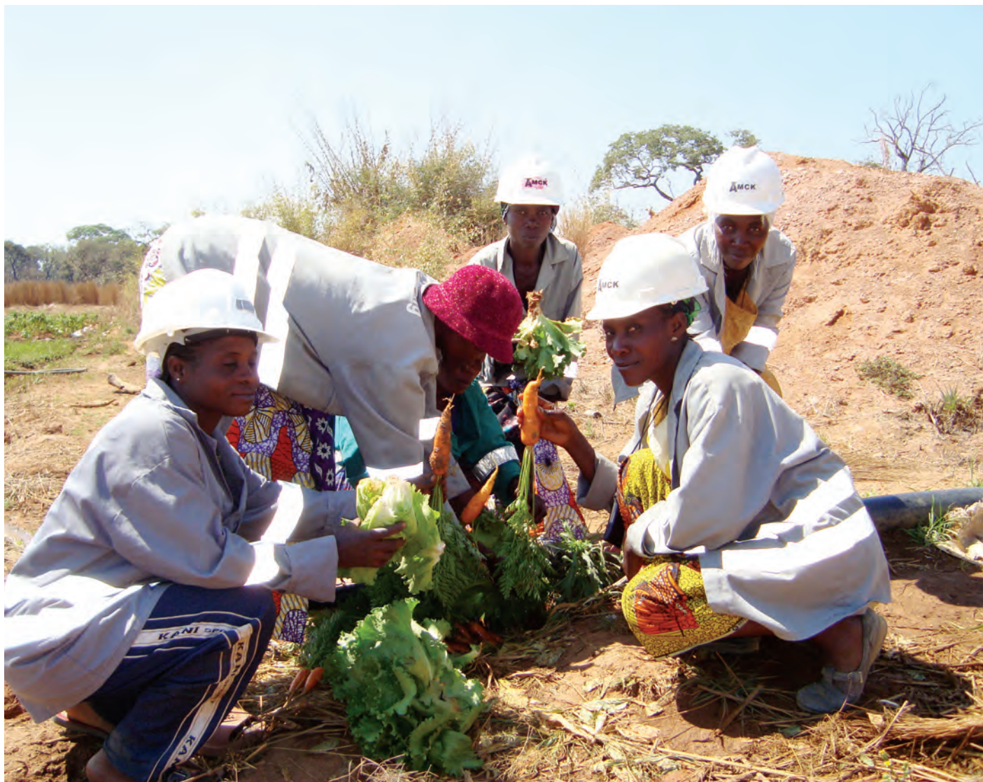
Women farmers prepare their vegetables for sale at Anvil Mining's community programmes in the DRC

and mining companies in Africa think about delivering on their social responsibilities... they build roads and bridges for access, put in water wells for potable water, establish clinics at mine sites to support their workers, and build schools for the children of their workers," Turner said.