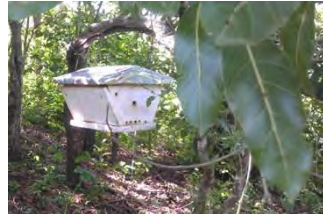
Beekeeping training and hives installation