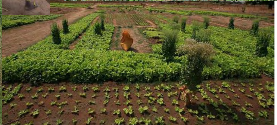
Dieu village vegetable garden