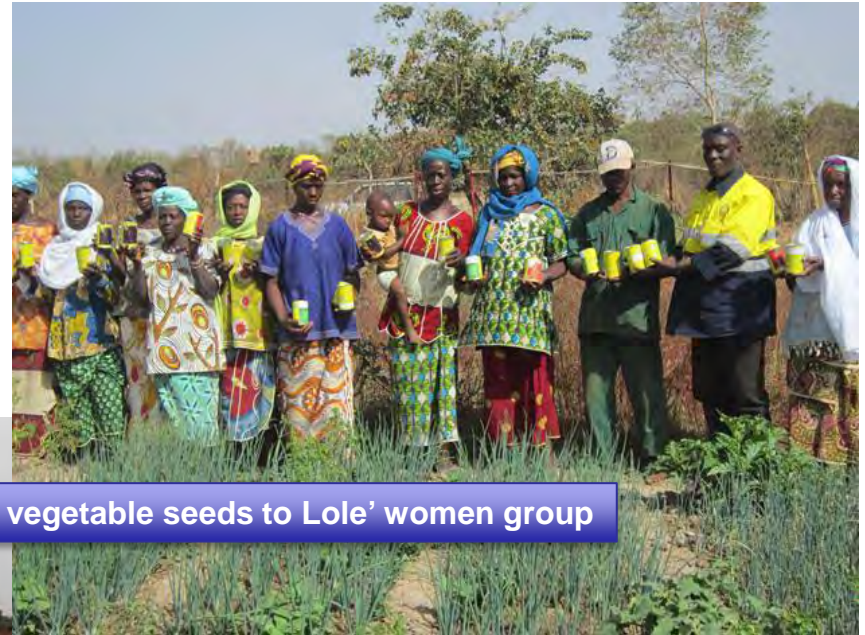
Donation of vegetable seeds to Lole' women group